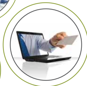
Digital Asset Management